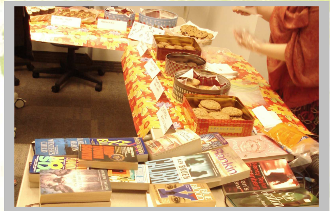
Book and Bake Sale

Held in May at Cancer Care Ontario and the University of Toronto raised a total of $295!