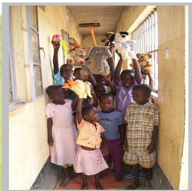
The children show their new toys